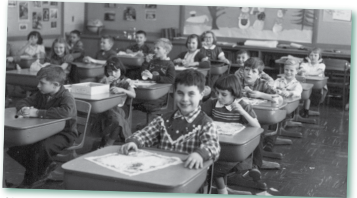
Classrooms in 1955 featured rows of desks. Today, elementary classrooms are less rigidly defined, allowing teachers to adapt to the learning styles of all students.