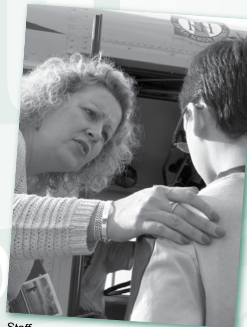
Staff members take a special interest in each child to foster their intellectual and personal development, and to prepare them for responsible citizenship, productive employment, and lifelong learning in a global community.