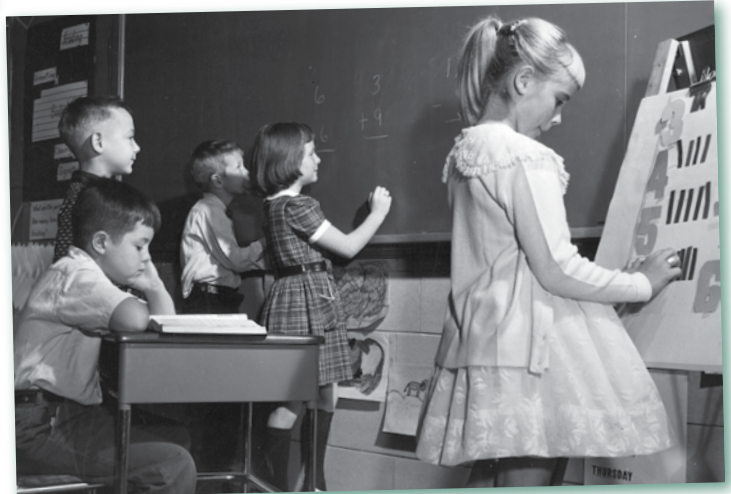
Regardless of the era, Rush-Henrietta continues to help students learn basic fundamentals to ensure lifelong success.