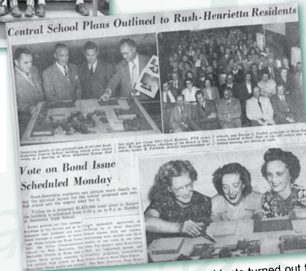
Hundreds of Rush and Henrietta residents turned out for a special meeting in 1949 to learn more about the new school district's proposal to build the Rush-Henrietta Central School. Soon after, voters overwhelmingly approved the project.