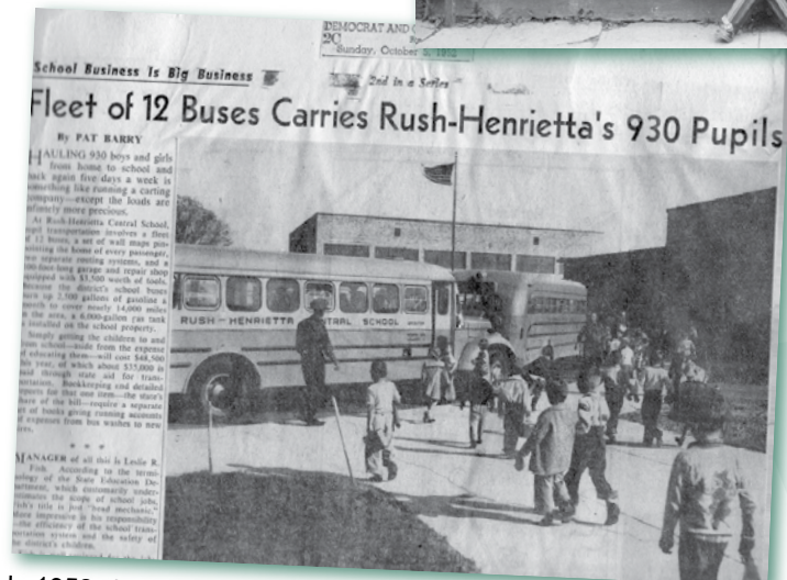
In 1952, the Democrat and Chronicle reported that Rush-Henrietta boasted 12 buses to transport 930 students. In 2006, 101 buses transport some 6,700 students more than 8,000 miles each day.