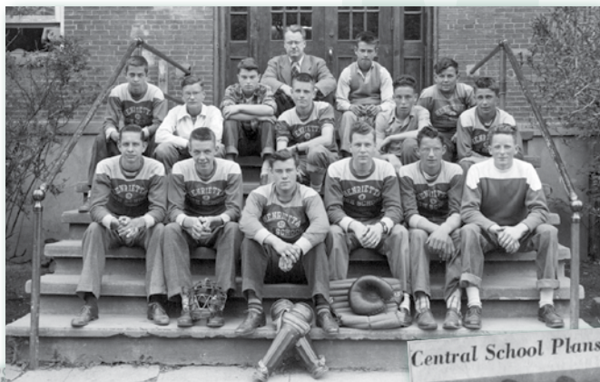
Students attending Henrietta High School posed for this picture in the 1930s. Before centralization, dozens of small school districts were scattered throughout the Rush and Henrietta countryside.