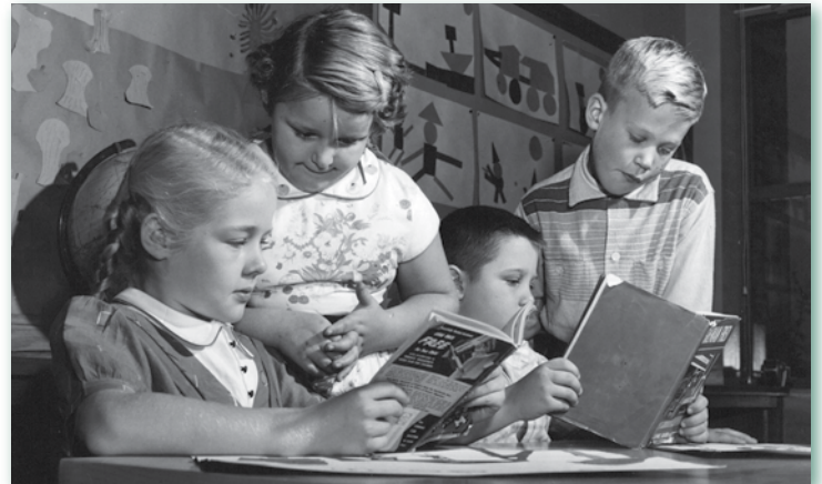
Reading in Rush-Henrietta schools is as important today as it was in the district's early days.