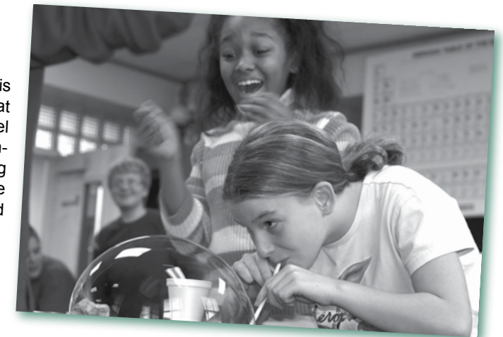
Lessons such as this science experiment at the middle school level are one way Rush-Henrietta is making its curriculum more understandable and relevant to students.