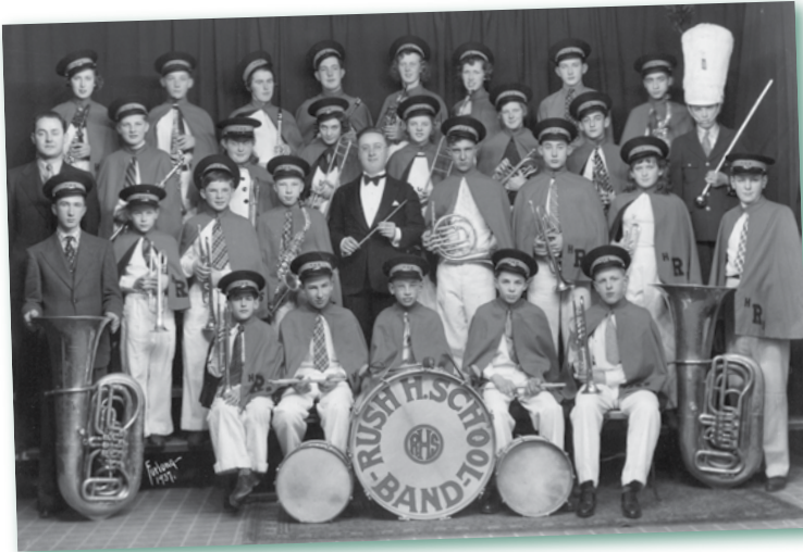
This picture shows the Rush High School band in 1938, eight years before centralization. Today, Rush-Henrietta is known nationwide for its outstanding music program.