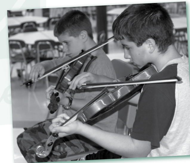
In 2006, the American Music Conference named Rush-Henrietta one of the Best 100 Communities for Music Education. In 2005, the Senior High School won a Grammy Award from the Grammy Foundation.