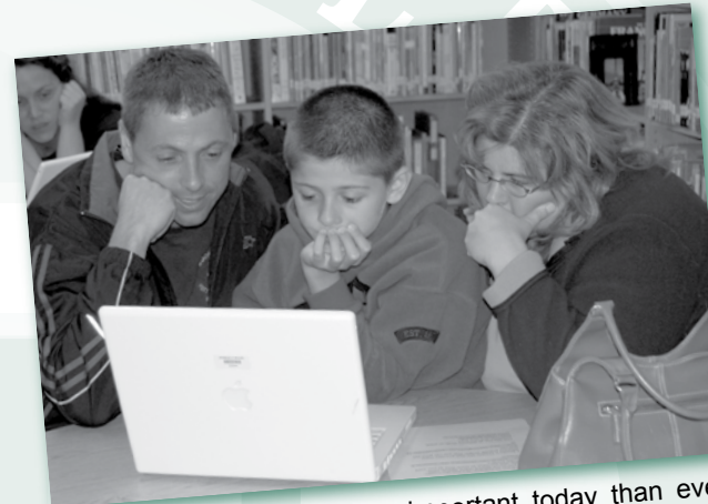
Parent involvement is more important today than ever in Rush-Henrietta. From parent group organizations to classroom helpers, there are hundreds of opportunities to become involved.