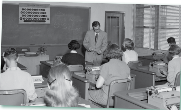
The technology has changed considerably in the past few decades, but Rush-Henrietta continues to integrate it into the classroom where appropriate.