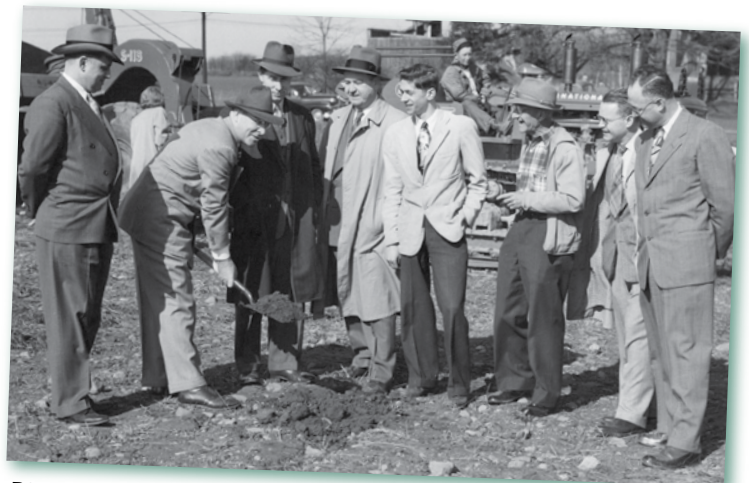
District leaders gathered in 1950 for a groundbreaking ceremony to build what is now called Roth Middle School.