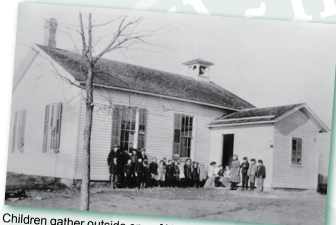
Children gather outside one of Henrietta's first schools, at the corner of Lehigh Station and Pinnacle roads. This photo was taken in the late 1800s, some 75 years before centralization.