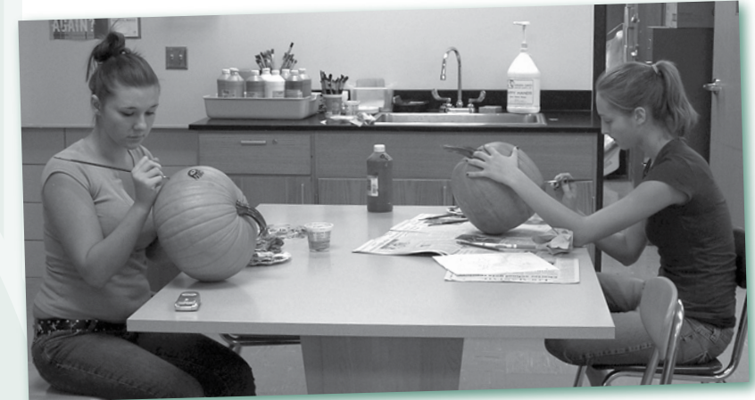
Rush-Henrietta students take community service seriously. At the Senior High School, the Community Art Club has been involved in several high-profile events, including the recent "Pumpkins on Parade."