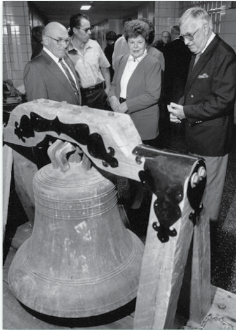
This bell, salvaged from Monroe Academy after it burned in 1974, was on display in 1996 during the district's 50th anniversary celebration.